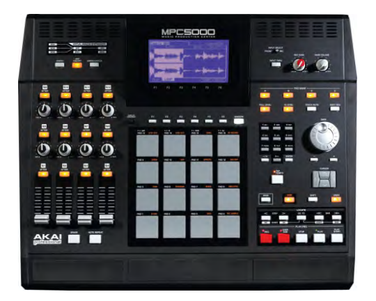
Figure 5 . Akai MPC 500 with "Chop Shop" waveform slicing activated. Regions of the waveform seen in the display can be played back directly from the grey pads in the middle of the device [9].

It should not come as a surprise that utilising waveforms as the representation of the audio material for performance purposes is found in DJ applications like Traktor DJ. After all, DJing as a cultural and artistic practice has been built on the foundation of dealing with recorded music in its phonographic form as material in the sense described by Großmann and Hanáček [2]. A similar tradition can be found in the sampling practices of hip hop, where devices like Akai's MPC are offering features to slice waveforms into small regions, which can then be played directly from pads on the hardware.