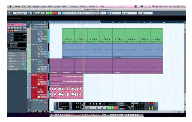
Figure 1. Note-based and waveform tracks in Cubase.

In actual systems, we encounter a mixture of note-based and waveform-centric interfaces. For example, in a production software, or digital audio workstation (DAW) like Steinberg Cubase, we see both note-based and waveform-based tracks, operating with different data formats, MIDI for notes and audio files for waveforms. These are the classic representations of these data formats, and they also represent the aforementioned traditional "Western" separation between notes and timbre.