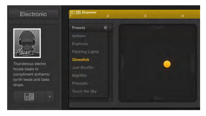
Figure 7 . The "Drummer" instrument in Apple's Logic Pro X, with the persona "Magnus" loaded [13].

Another example that greatly expands the waveformbased representation of sound is the "Drummer" feature in Apple's Logic Pro X production system. Here, a cultural context can be invoked by selecting a drummer-persona, which then makes available a prototypical variety of drum grooves supposedly expected from a drummer in this context. This high-level representation is interactive, as the user can change parameters like loud/soft or simple/complex, set complexity ranges for individual instruments, and also set a "Humanize" factor. This in itself is an interesting new representation, as it incorporates cultural semantics in an algorithmic rhythm generator, but it goes further by rendering the results of the rhythm generator as both note and waveform material into the main production environment. There, it can be subjected to further transformations in either domain, thus creating a highly flexible, integrated means of handling sonic material in an abstracted form.