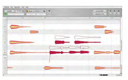
Figure 3 . A waveform that has been split into its tonal components and mapped to a piano roll representation in Melodyne DNA [10].